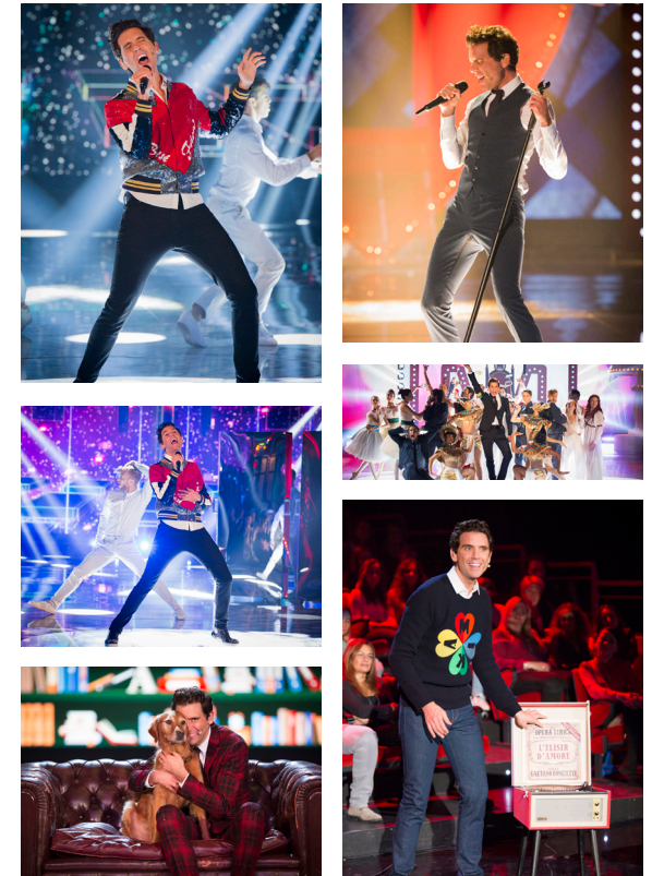
Photos of Mika the artist/the singer