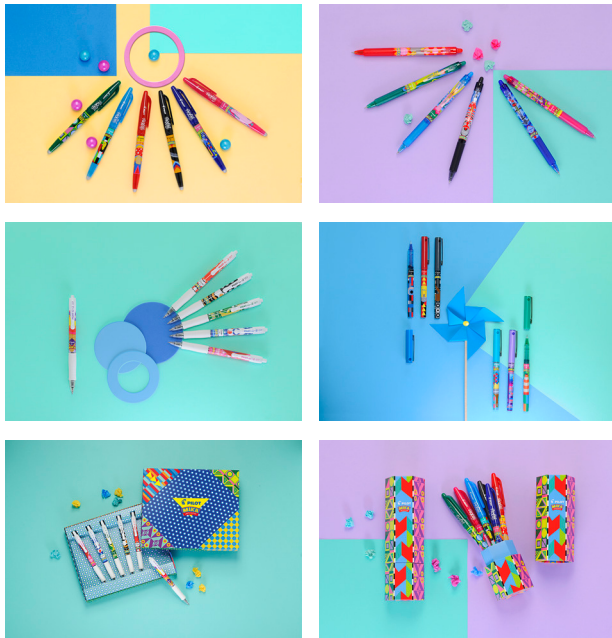
Photos of the limited editions